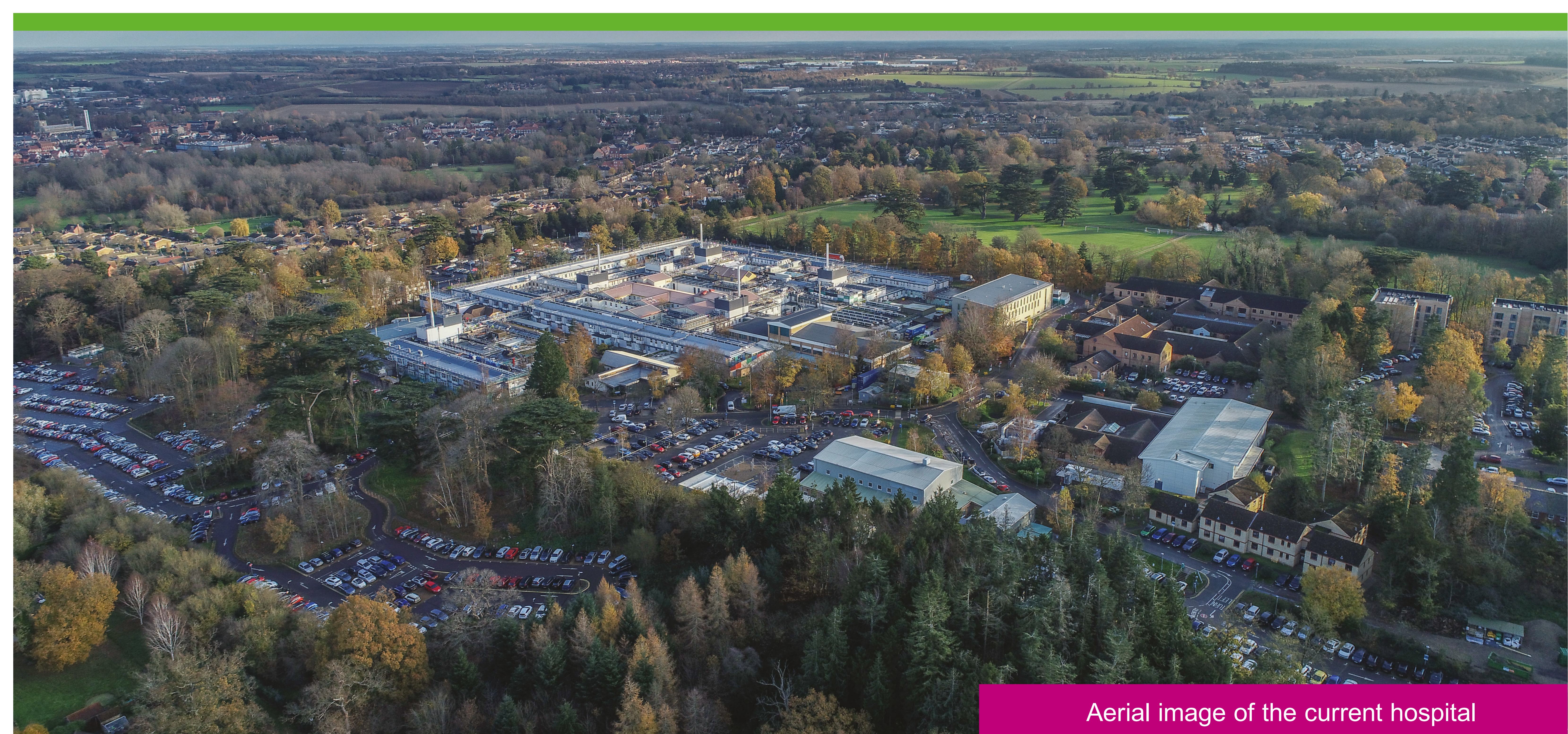
Aerial image of the current hospital