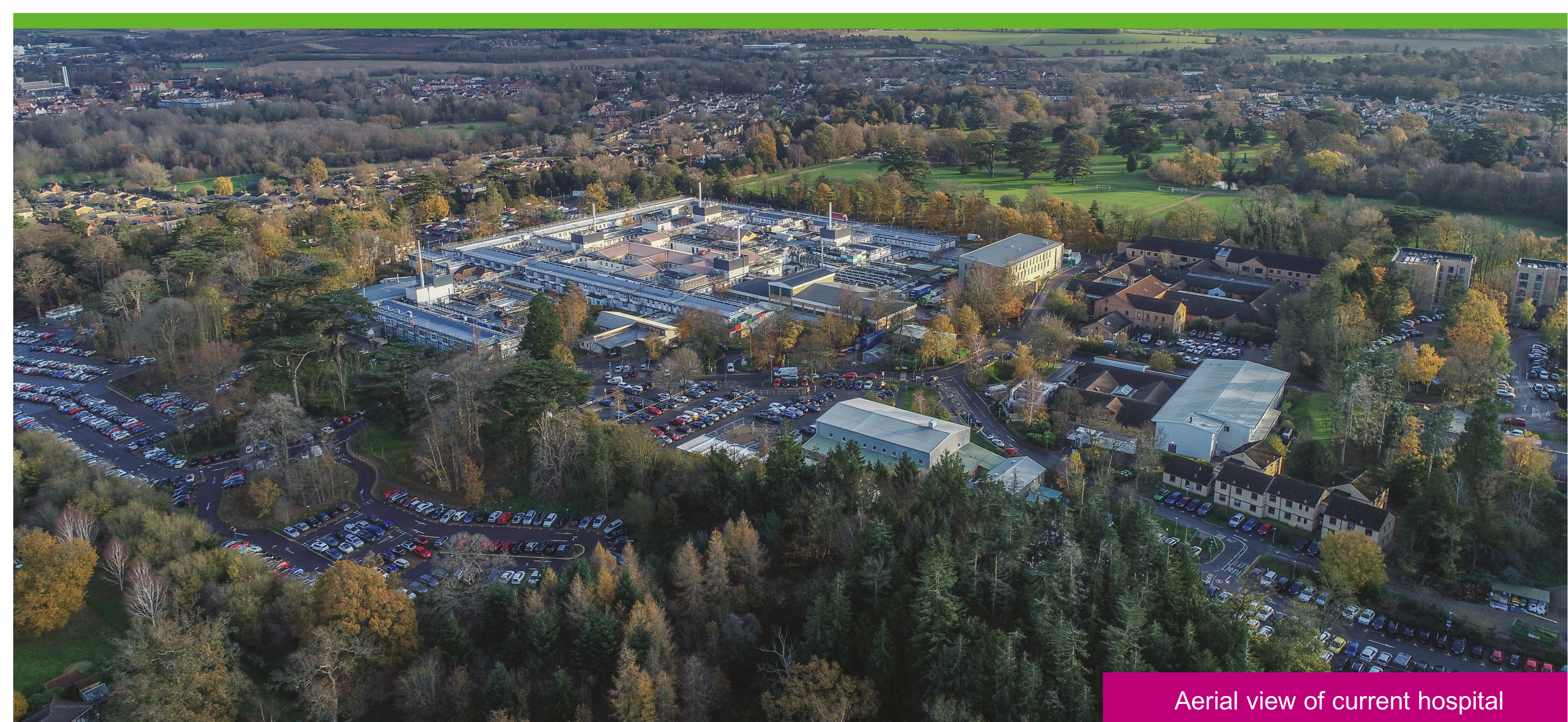
Aerial view of current hospital

West Suffolk Hospital has been serving the local community at its current location at Hardwick Lane since 1974. The hospital has continued to evolve on the site with significant renovations and the addition of several new buildings.