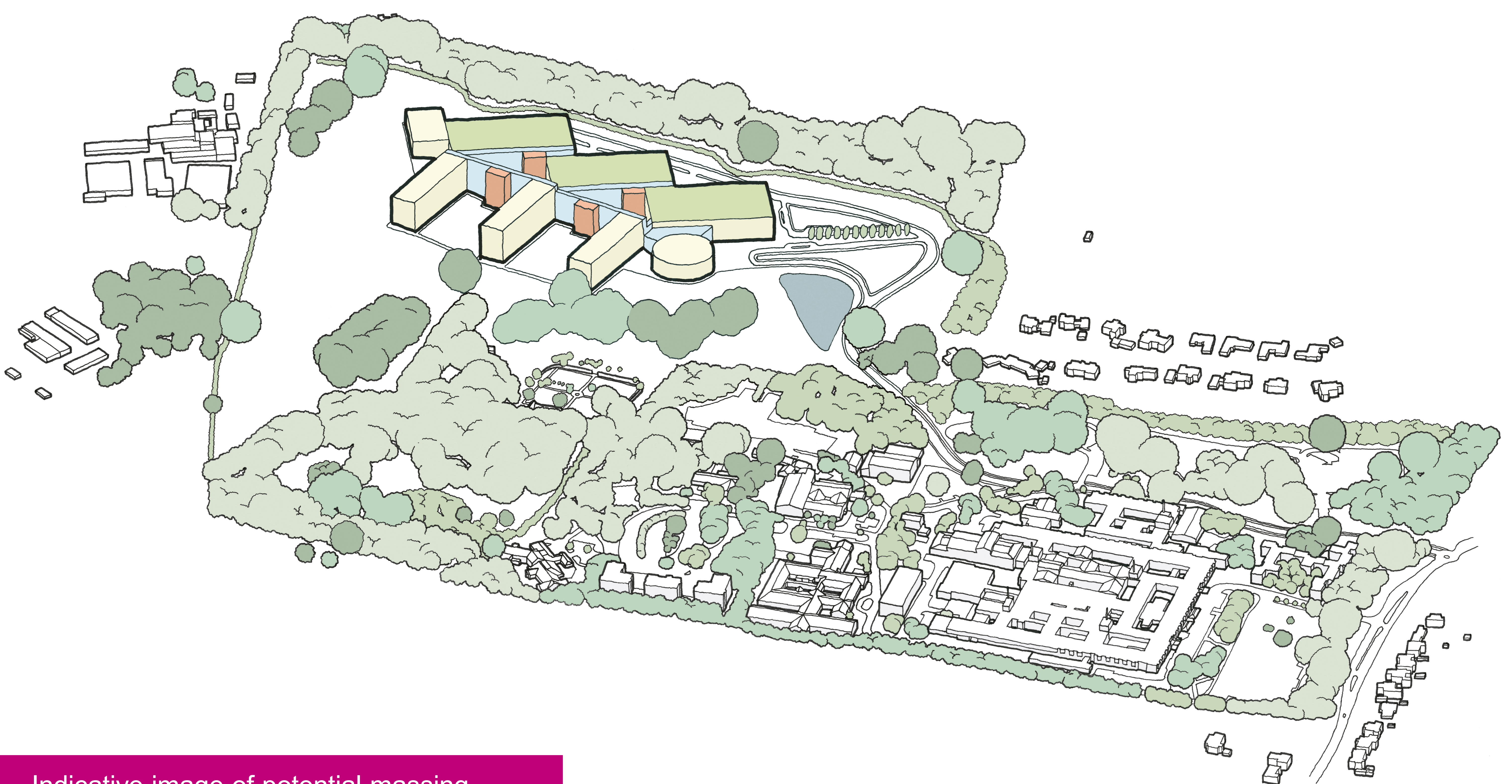
Indicative image of potential massing

If you have any questions as you're reading the boards, please speak to a member of the team who will be happy to talk you through the proposals in more detail.